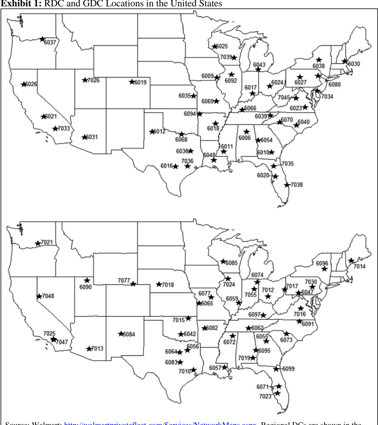
Exhibit 1: RDC and GDC Locations in the United States

Regional DCs are shown in the top map and Grocery DCs are in the lower map. The numbering of DCs varies by the unit under consideration for that location. If the second number is a "0," it is the DC. If the second number is an "8," it is the Transportation Office; a "7" indicates the Truck Maintenance Garage. Data were not available for all Grocery DCs, because some are serviced by other transportation providers.