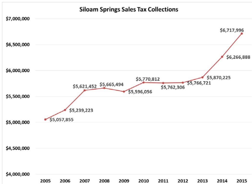
FIGURE 2: SILOAM SPRINGS SALES TAX COLLECTIONS

Spending from the visitors to the proposed whitewater and mountain biking park in Siloam Springs would provide additional sales tax revenues for the City of Siloam Springs. Current sales tax collections of two percent generated revenues of $6.72 million in 2015. On average, since 2005, sales tax revenues have grown 2.9 percent annually, although in the 2014 and 2015 the sales tax revenues grew by 6.8 percent and 7.2 percent. The chart below shows the growth in sales tax collections since 2005.